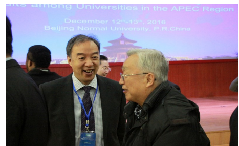
Professors chat during coffee break

lished in 1989. It is a forum of 21 countries in the Pacific-rim that in a way promotes free trade throughout the Asia-Pacific region. Those countries jointly work towards the realization of free and open