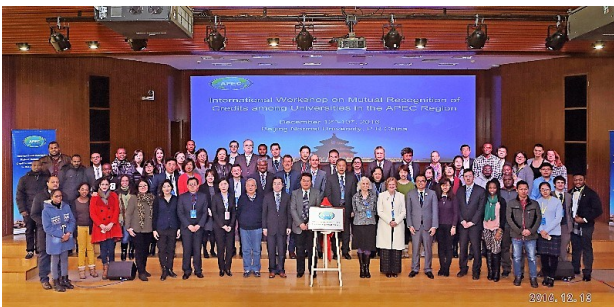
Presenters and attendees pose for a group photo

The workshop was being facilitated by BNU's Faculty of Education members and lasted for two days. In those two days, a range of officials